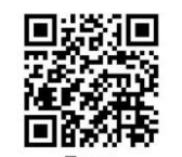
East Quantoxhead - Kilve